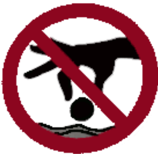
Don't Throw Things into the Exhibits