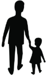
Stay with an Adult