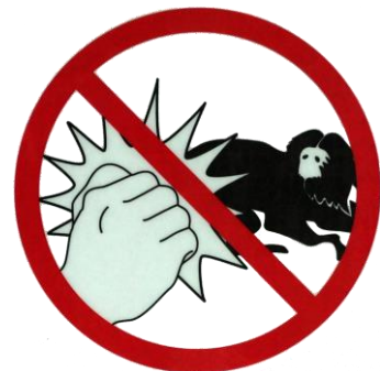
Don't Hit the Glass